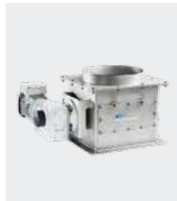
Rotary Lump Breaker