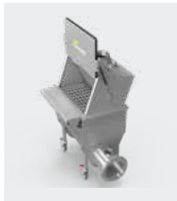
AMC Screw Feeder