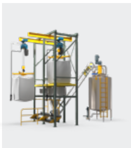
Reusable Bulk Bag Discharger