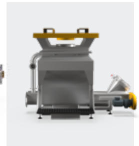
Bulk Bag Screw Feeder