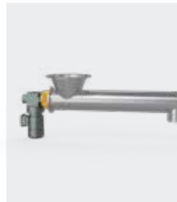
Dosing Screw Feeder