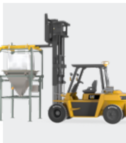
Disposable Bulk Bag Discharger